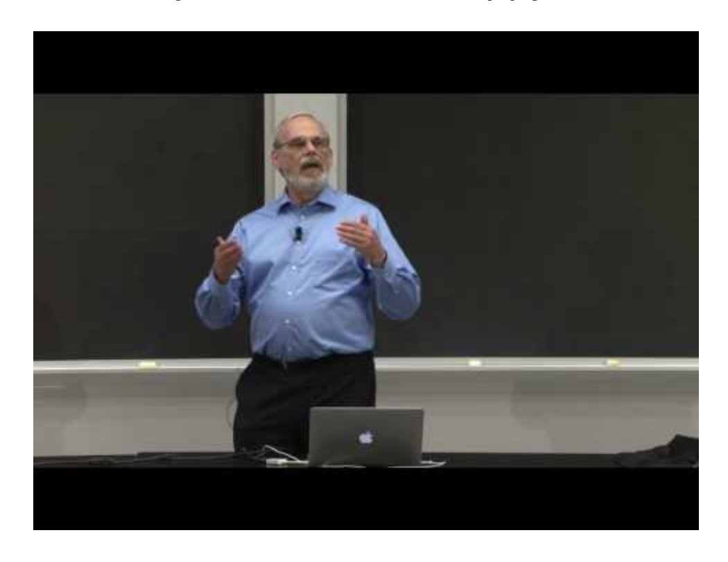
Click the image above for a video: MIT's John Guttag introduces machine learning

Welcome to this course on classical machine learning for beginners! Whether you're completely new to this topic, or an experienced ML practitioner looking to brush up on an area, we're happy to have you join us! We want to create a friendly launching spot for your ML study and would be happy to evaluate, respond to, and incorporate your feedback.